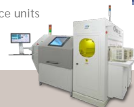
Onyx Wafer Inspection System